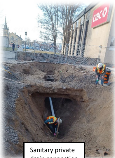
Sanitary private drain connection